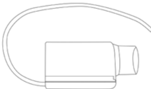
Figure 1: Flowhead Complete

Recommended cleaning method where a new SpiroSafe filter is used for every subject: