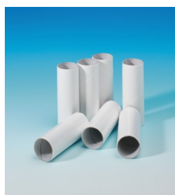
Pediatric Mouthpiece Order #3301 $17/bag of 100