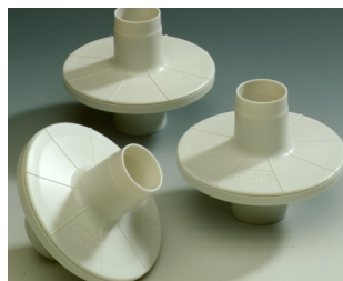
SpiroSafe Filter Order #3385 $110/box of 100

Why Micro Direct? - Only Micro Direct offers a complete line of automated spirometers designed to meet your needs. Each utilize inexpensive, readily available mouthpieces and meet all ATS/ERS standards. Micro Direct's spirometry experts will help you choose the right spirometer and then fully support your staff from proper testing techniques through billing questions; and all Micro Direct spirometers are backed by a 30-day money back guarantee.