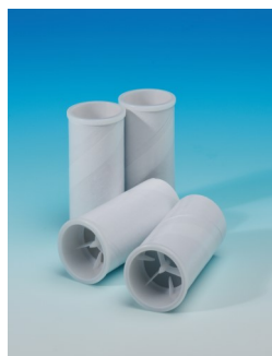
MicroCheck One-Way Mouthpiece Order #3395 $75/box of 200