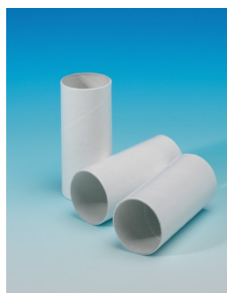
Adult Cardboard Mouthpiece Order #3314SB or #3314B5 $30/box of 200 $60/box of 500